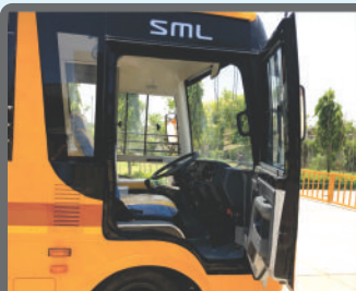
Wider Best in Class Door Opening Angle for Ease of Entry/Exit