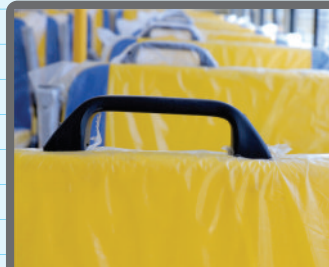
Grab Handle with every seats