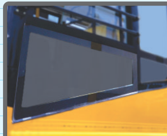
Side Peep Window