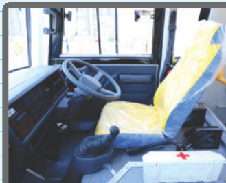
Aesthetically Designed Driver Cabin with Smartly placed Controls.