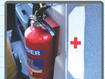
Fire Extinguisher & First-Aid kit