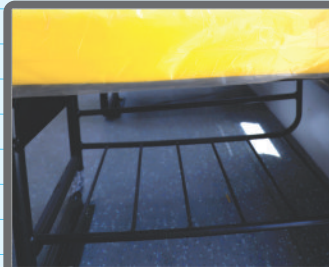
Children's Bags Space Under Seat Cushion