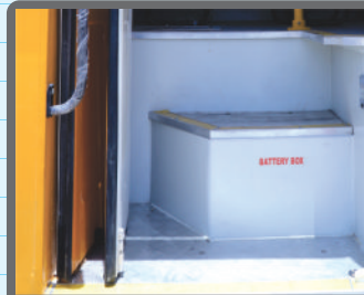
Low Footstep for Easy Entry/Exit