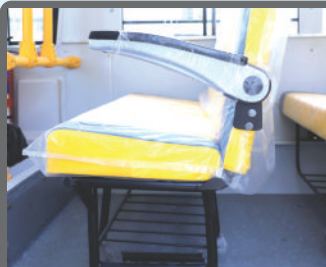
Comfortable Seats with Arm Rests