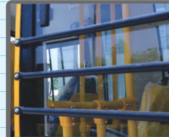
Windows Guard-rails for Children's Safety