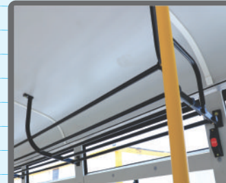
Wide Full Length Hatrack