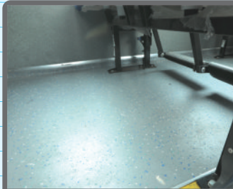
Anti Skid Floor