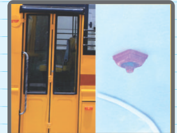
Buzzer Sound with Door Opening/Closing