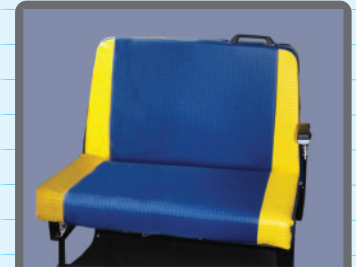
Fire Retardant Upholstery