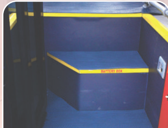
Low FootStep Height for Easy Entry/Exit