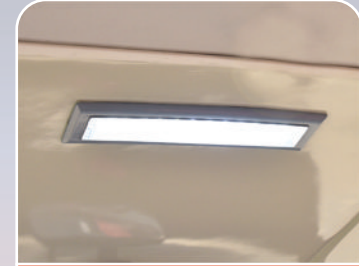
LED Saloon Lights