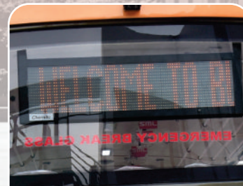
LED Display Board*