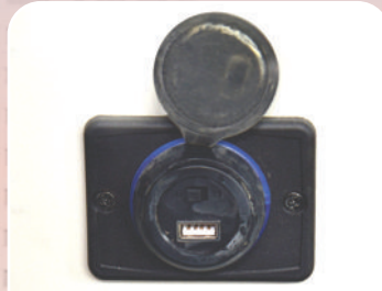
Individual USB Mobile Charging Point