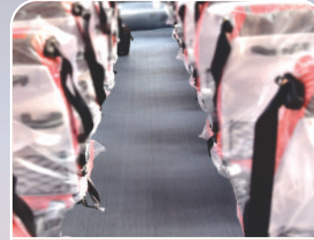
Best in Class Gangway