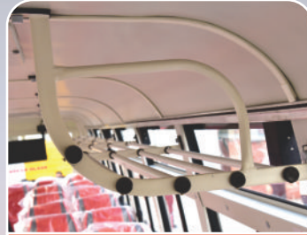
Full Length & Wide Hatrack