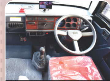
Adjustable Power Steering for Less Driver Fatigue