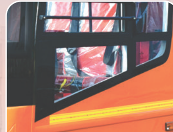
Peep Window for Better Visibility on Sides