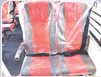
Comfortable Seats with Arm-rests & Seat Belts*