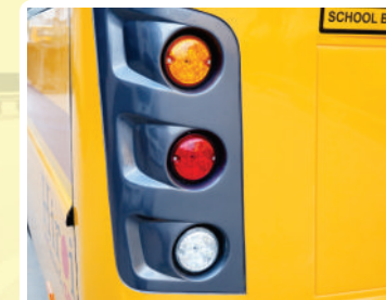
LED Rear Lamps