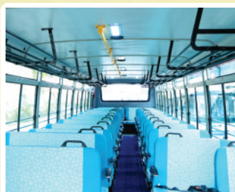
Spacious Area for Ease of Movement