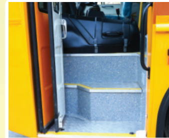
Low Step Height