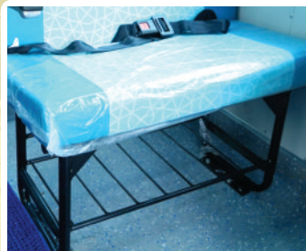
School Bag Rack