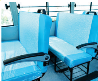
Anti- Bacterial Laminated Fire Retardant Upholstery