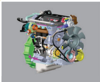
Equipped with Efficient BS-VI Engine