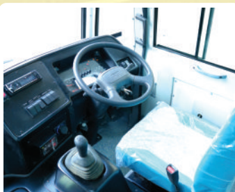
Aesthetically designed Drivers Cabin with Smartly placed controls