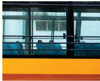
Window Guard Rails